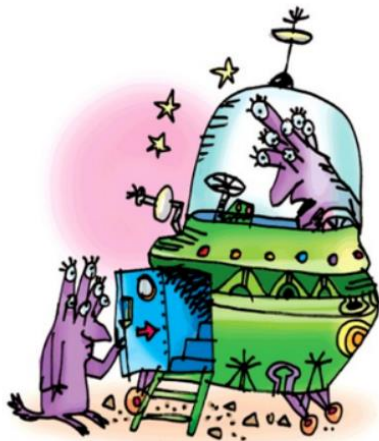
shut the door

2. door , poor , moor , floor , poorly , indoors , doorway , moorhens