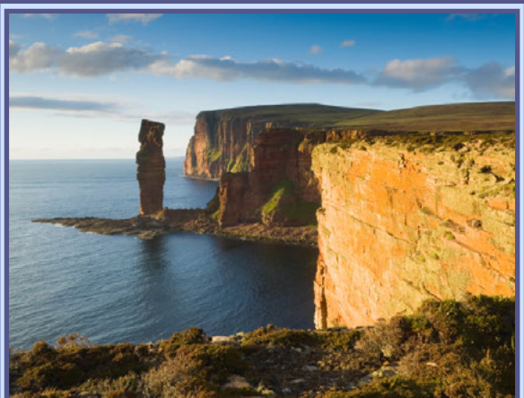
Old Man of Hoy, Orkney Islands