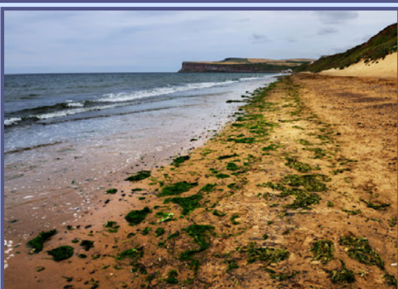
Saltburn by the Sea, East Riding of Yorkshire