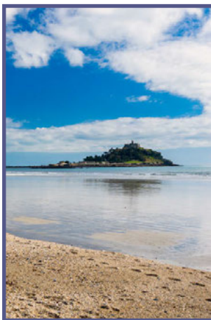
St. Michael's Mount, Cornwall