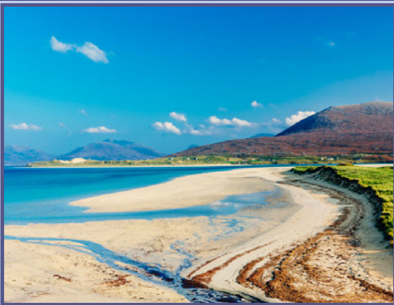
Luskentyre Beach, Isle of Harris