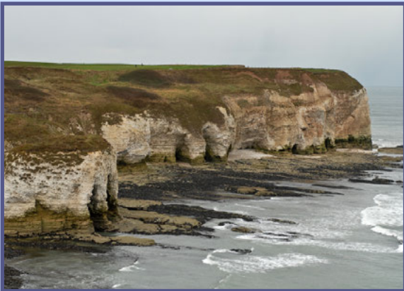
Flamborough, East Riding of Yorkshire