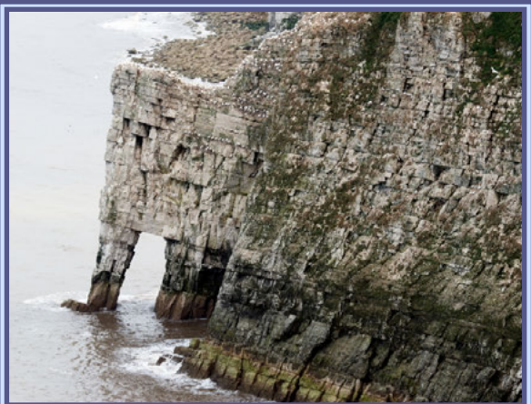
Bempton Cliffs, Yorkshire