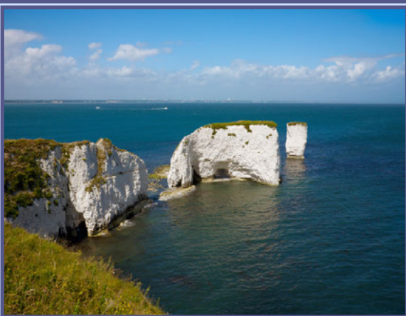
Old Harry Rocks, Dorset