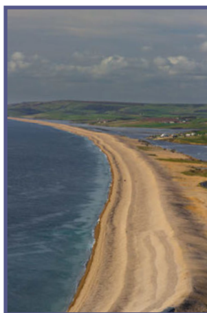
Chesil Beach, Dorset