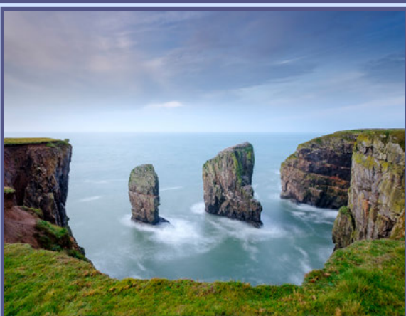
Elegug Stack Bay, Pembrokeshire