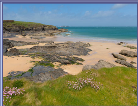
Harlyn Bay, Cornwall