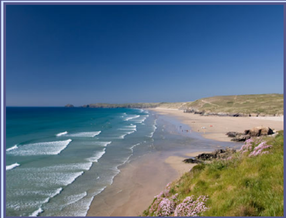
Perranporth Beach, Cornwall