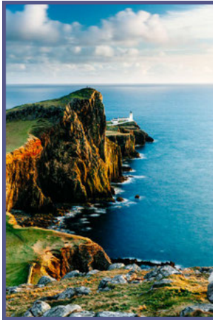
Neist Point, Skye