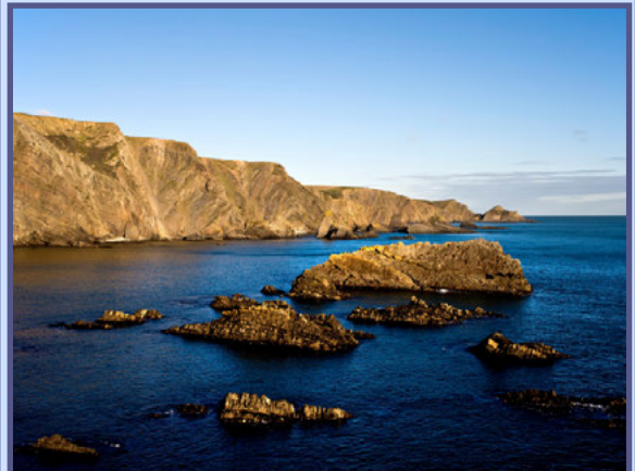
Hartland Point, Devon